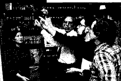
Science fiction: at home among microphones, Gallo announcing his "discovery" of the AIDS virus in April 1984; chatting with lab associates (including, left, Flossie Wong-Staal); and enjoying his proximity to a momentarily slender Elizabeth Taylor, with C. Everett Koop and Luc Montagnier

mor virus was replaced among scientists by human rumor virus . A cure for cancer was not imminent after all.